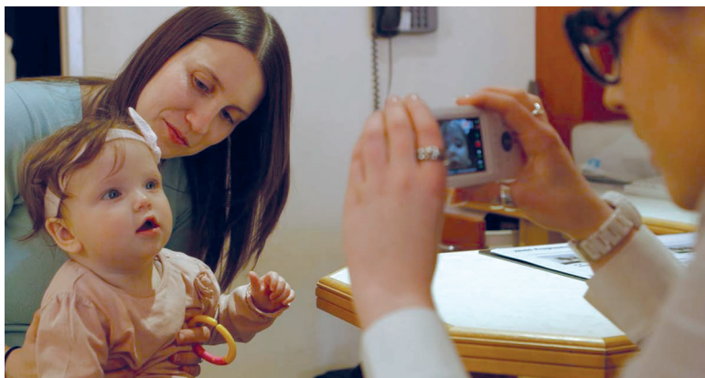
FIGURE 2 The Volk EyeCheck is helpful with unco-operative subjects

The Volk EyeCheck (VEC) is a handheld digital diagnostic gathering measurement tool that captures and displays external eye measurements quickly and accurately. We have recently added the VEC to our pre-test routine with assessing children. It is as easy as taking a photo and anyone can be trained to use it. The